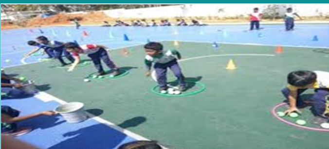
Sports & Games