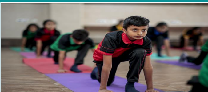
Yoga and culture