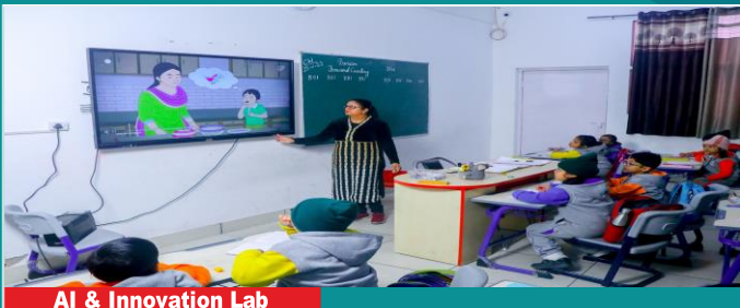
AI & Innovation Lab

Activity Rooms: The school greatly emphasizes providing a platform to excel in co-curricular domains. It has facilities such as a Robotics Lab, Arts and Crafts rooms, Vocal Music rooms, Dance studios, Guitar and Instrument rooms, and Theatre spaces in each wing, where qualified teachers train the students.