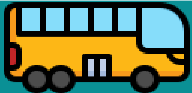
Fleet of Buses with Speed Governors