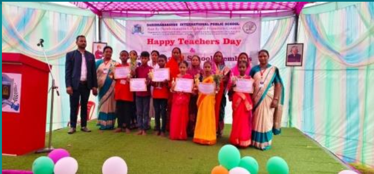
Photograph of the Teacher's Day Daridranarayan International Public School